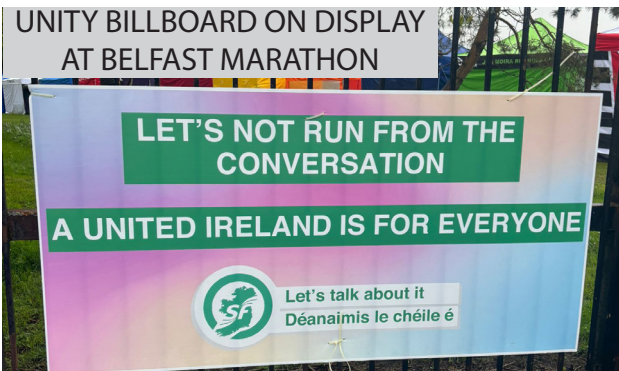
UNITY BILLBOARD ON DISPLAY AT BELFAST MARATHON